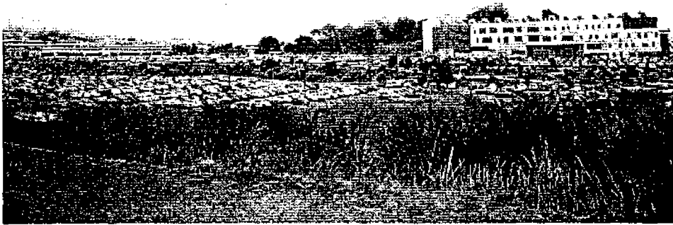
View of far end of Balboa Reservoir parking area at 9:30- out of frame portion is full. Taken Aug 28 2017.

For more information, visit the Balboa Reservoir Community Advisory Committee website . ( http://sf-planning.org/balboa-reservoir-cac-meeting-schedule )