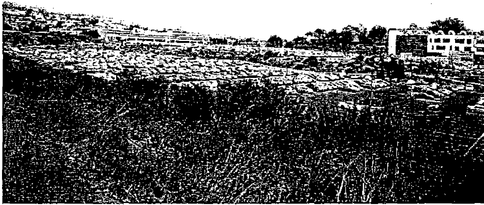
View of far end of Balboa Reservoir parking area at 9:30- out of frame portion is full.