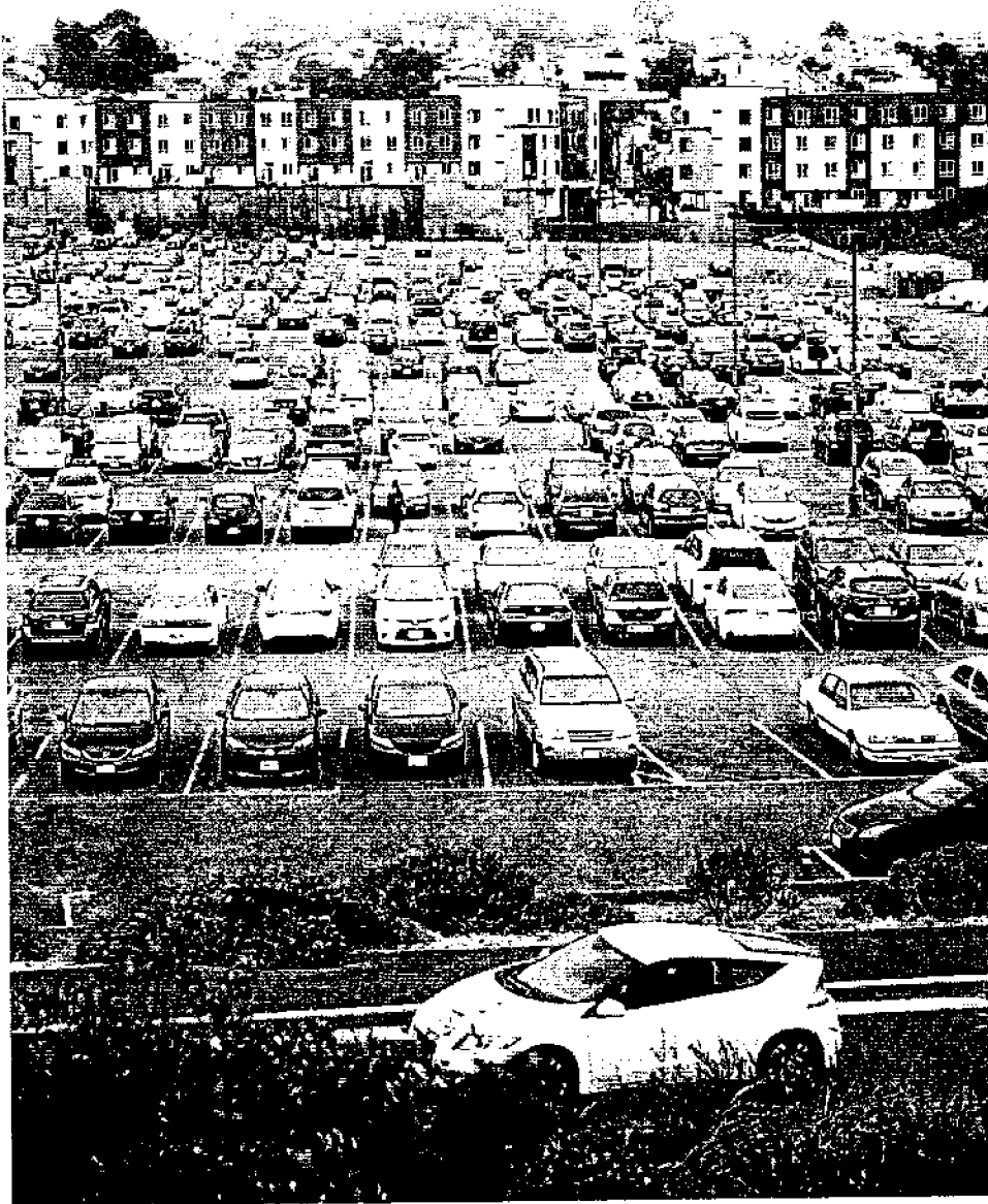
Lower parking lot (Balboa Reservoir) at 11:30.