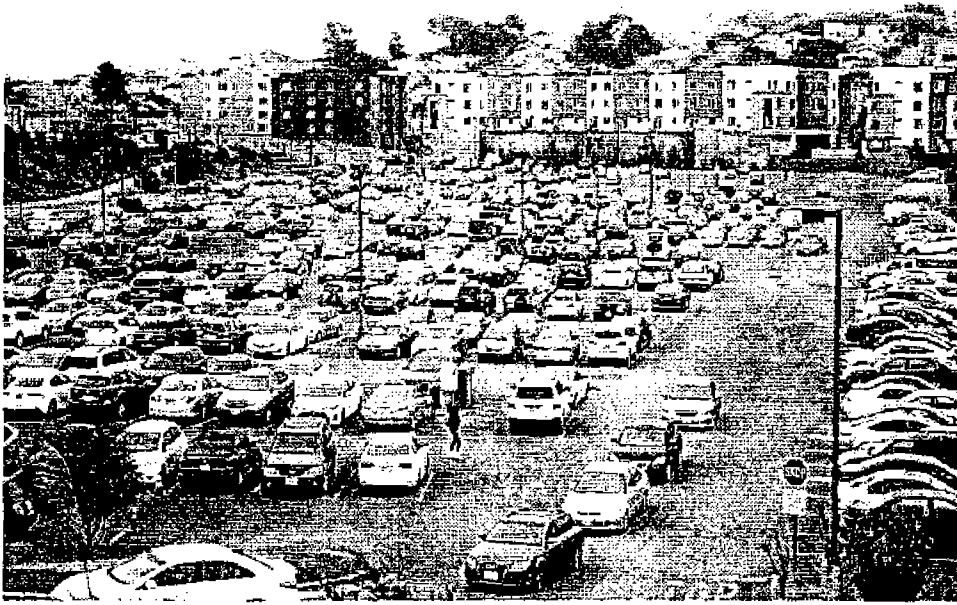
Balboa Reservoir parking at 12:30 as classes get out.

September 13, 2017 The Guardsman By Bethaney Lee